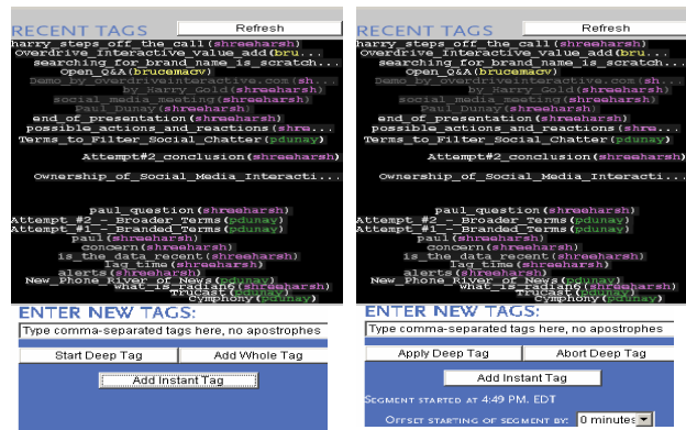
Figure 1: The left figure shows the default state of the LCD. The right figure shows the state of the LCD when a deep tag segment has been started.

Tags can be words or phrases of any arbitrary length and can be of three types. Whole tags apply to the whole conversation. They are “one-click” tags i.e. the user types in the tags in the textbox provided, separates them with commas, and clicks “Apply Whole Tag”. Deep tags apply to a part of the conversation (i.e. a segment of audio). They are “two-click” tags i.e. the user needs to click two buttons in order to apply a deep tag to a segment. First, the user clicks on “Start Deep Tag” when she hears something she wants to tag. A message to the effect of “Segment started at 11.40 am” (i.e. the time at which the segment is started) is shown. Because some time will elapse between users hearing something interesting and deciding to tag it, we allow the user to offset the beginning of a segment: the segment can start n minutes before the user pressed the “Start Deep Tag” button. When the user thinks the segment she wishes to tag is over, she presses “Apply Deep Tag” and the tags get applied to that segment of the audio. Instant tags apply to the current instant of the conversation. They can be applied with a single-click. Instant tags make possible the nesting of segments: allowing a user to apply an instant tag after starting a segment for deep tagging.